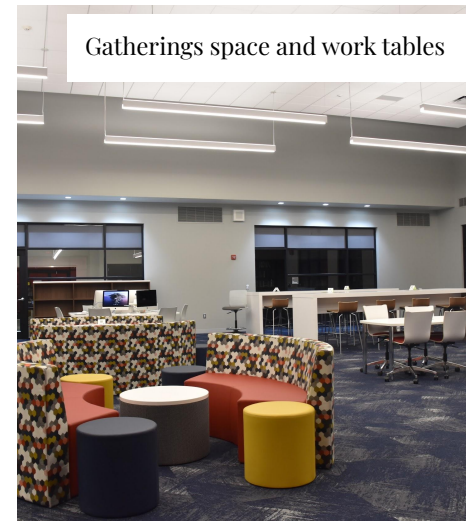
Gatherings space and work tables