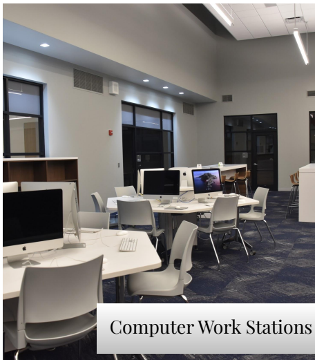
Computer Work Stations