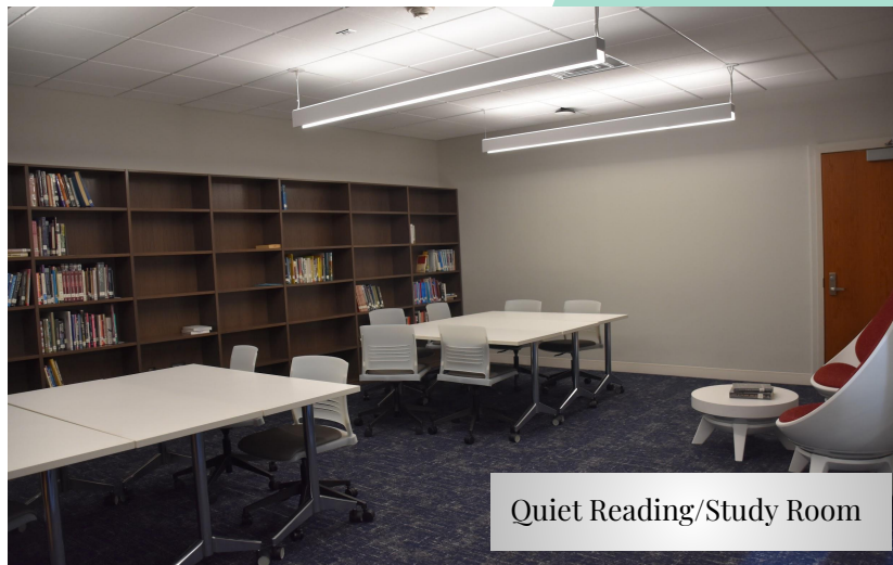
Quiet Reading/Study Room